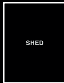
DETACHED STRUCTURE (NOT IN POSITION)