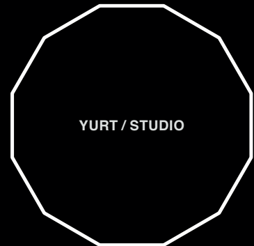
DETACHED STRUCTURE (NOT IN POSITION)