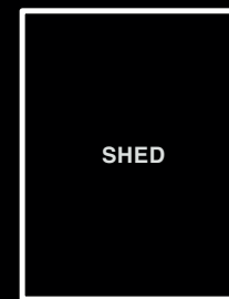
DETACHED STRUCTURE (NOT IN POSITION)